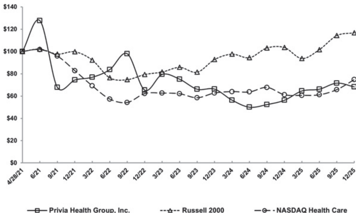
COMPARISON OF 56 MONTH CUMULATIVE TOTAL RETURN* Among Privia Health Group, Inc., the Russell 2000 Index and the NASDAQ Health Care Index

The following graph and related information show a comparison of the cumulative total return for our common stock, Russell 2000 Index, and NASDAQ Health Care Index between April 28, 2021 (the date our common stock commenced trading on the NASDAQ) through December 31, 2025. All values assume an initial investment of $100 and reinvestment of any dividends. The comparisons are based on historical data and are not indicative of, nor intended to forecast, the future performance of our common stock.